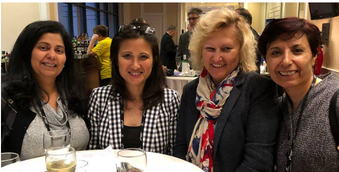
Attendees at the A&A conferences had the chance to network at receptions in Roanoke and Falls Church (pictured).